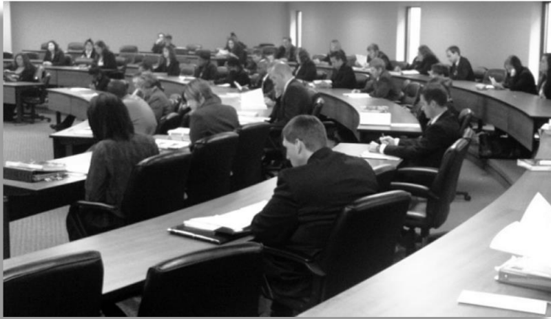
YATES LECTURE HALL

Students must have obtained a cumulative 2.0 grade point average in order to meet graduation requirements. The cumulative grade point average is determined by dividing the total number of quality points by the total number of hours attempted. When failed courses are repeated, only the highest grade will be used in determining the grade point average, and hours attempted will be used only once.