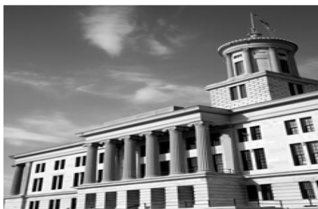
STATE CAPITAL BUILDING

John A. Gupton College is nestled in the middle of downtown Nashville, just minutes from many of the cultural attractions that make Nashville a great city. Nashville, with its beautiful skyline, the state capitol, convention center, museums, and Riverfront Park, offers many features enjoyed by all ages. Music Row, the Grand Ole Opry, and the world-renowned General Jackson Showboat are just a few of the reasons Nashville is known as Music City U.S.A. Nashville is the home of numerous sporting events such as the National Football League “Tennessee Titans” and the National Hockey League “Nashville Predators” just to name a few.