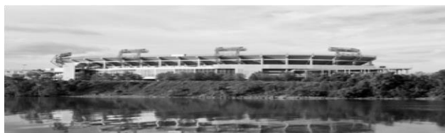
HOME OF THE TENNESSEE TITANS