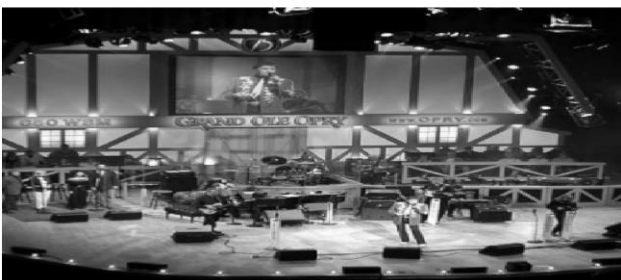
GRAND OLE OPRY